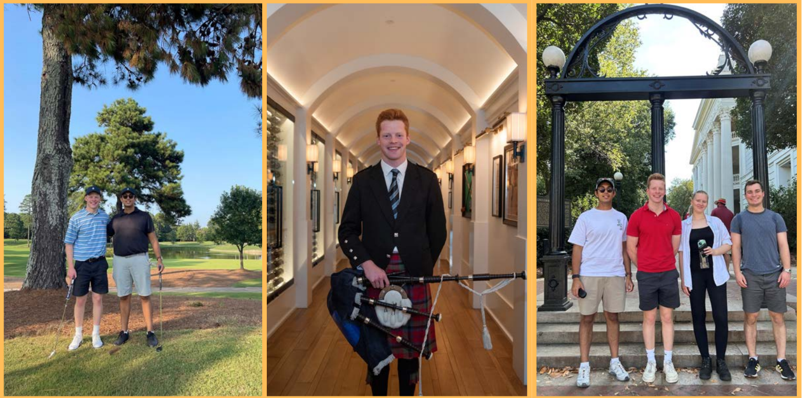
Left to Right: Atlanta Athletic Club's biggest fans; piping at Atlanta Athletic Club's 125th Gala Dinner; and 24BJS posing in front of UGA's iconic Arch on North Campus