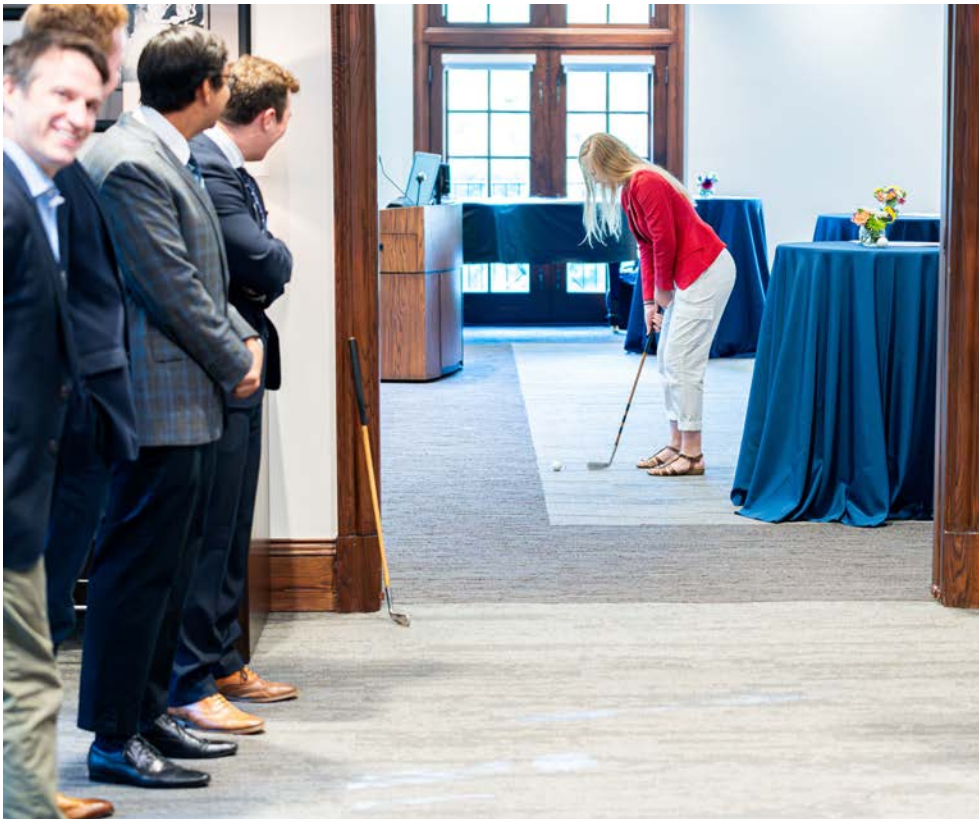
AJ lining up her winning putt as the other scholars watch on.